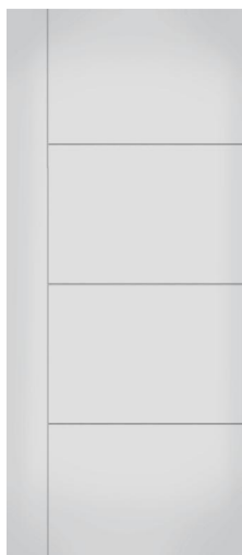
5 Horizontal Panel