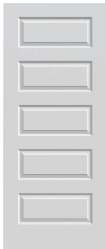
Riverside 5 Panel