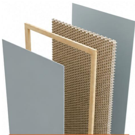
Honeycomb Standard Solution