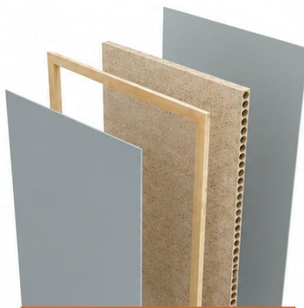
Tubular Chipboard Particules Tubulaires