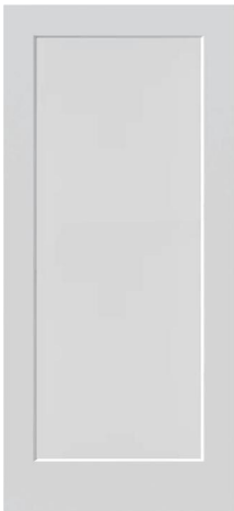
Shaker Style 1 Panel