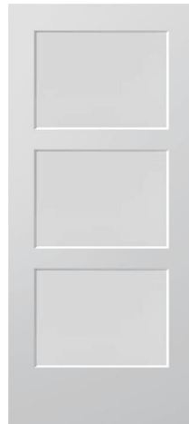
Shaker Style 3 Panel