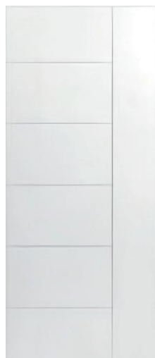
7 Horizontal Panel

*Molded panel doors offer timeless styling with a variety of raised and recessed profiles—ideal for traditional, classic, or decorative interiors seeking added detail and depth.