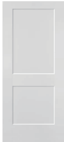
Shaker Style 2 Panel