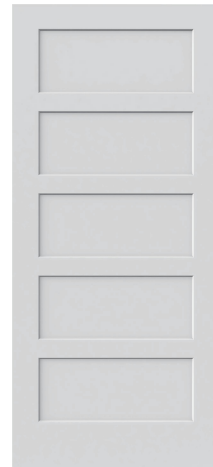
Shaker Style 5 Panel

*Featuring clean lines and flat panels, Shaker doors bring a minimalist, modern touch to any interior—perfect for contemporary homes and versatile enough for transitional spaces.