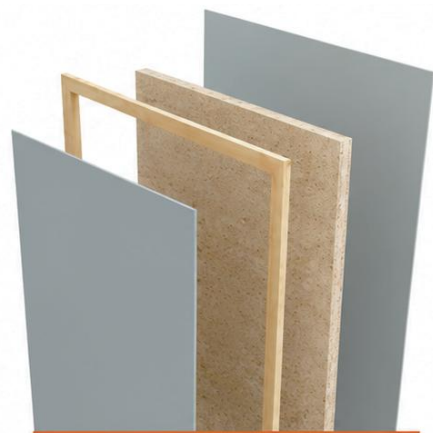
Full Chipboard Particules Solides