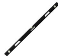
Yardstick or Long Level