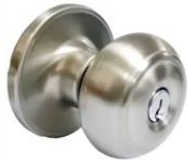
Door Lock Combo Packs